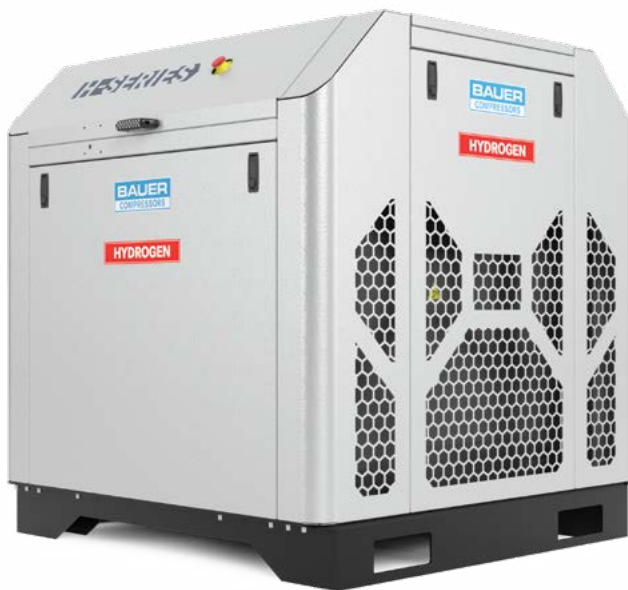
› BAUER MICRO SERIES H120