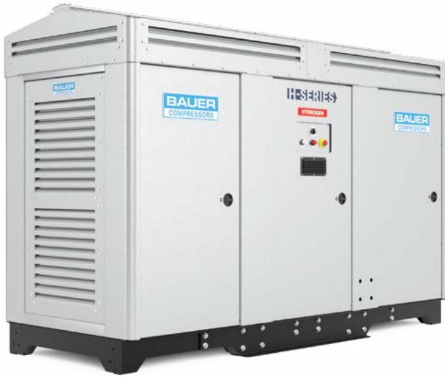
› BAUER COMPACT SERIES® Duplex