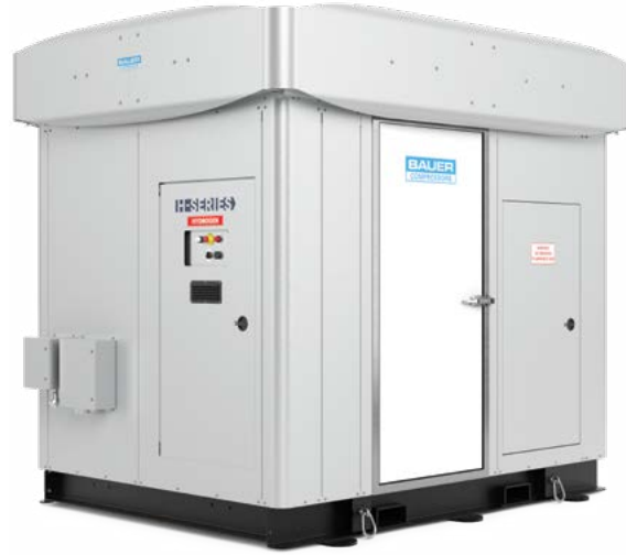
› BAUER H-SERIES