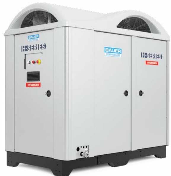
› BAUER COMPACT SERIES® Simplex