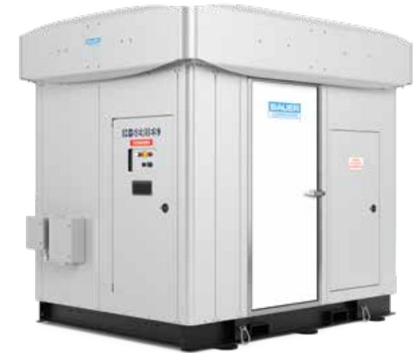
› BAUER H-SERIES