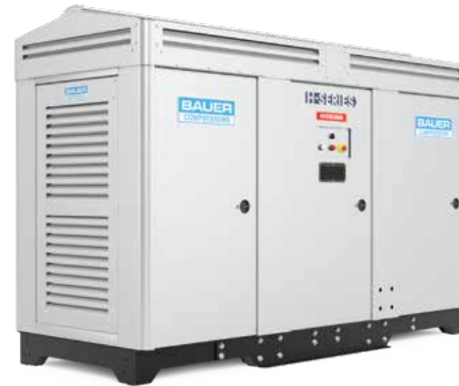
› BAUER COMPACT SERIES Duplex