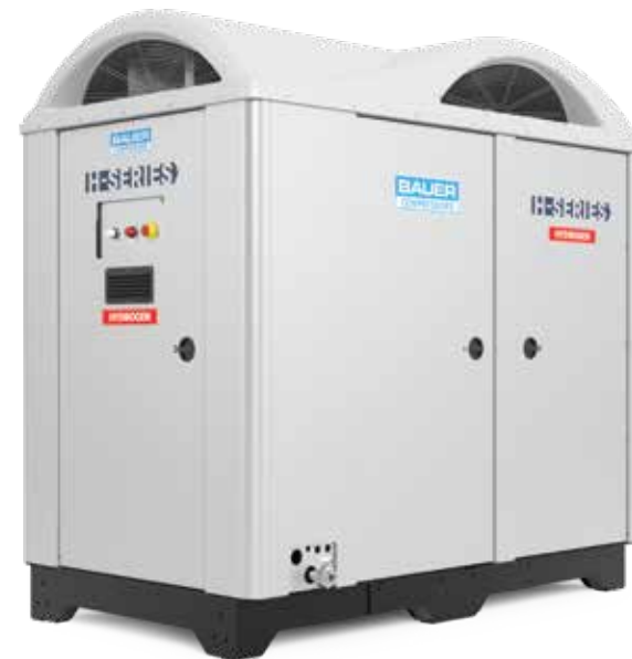
› BAUER COMPACT SERIES Simplex