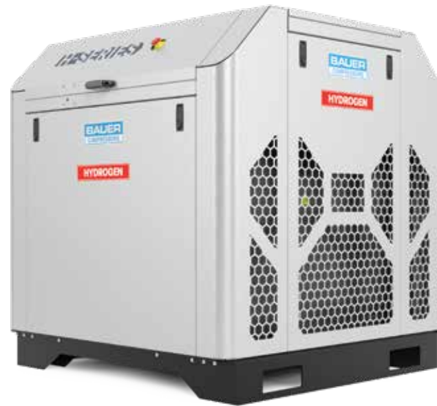
› BAUER MICRO SERIES H120