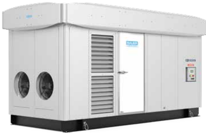
› BAUER H26 X-FILL