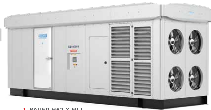
› BAUER H52 X-FILL